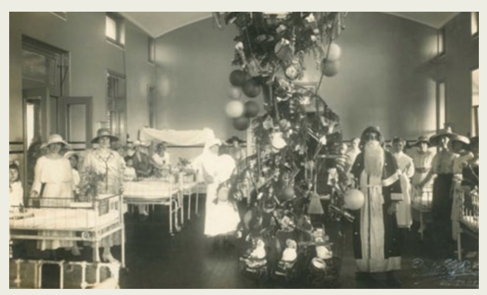
Our Staff Community Fund is the oldest and one of the largest workplace giving programs in Australia.