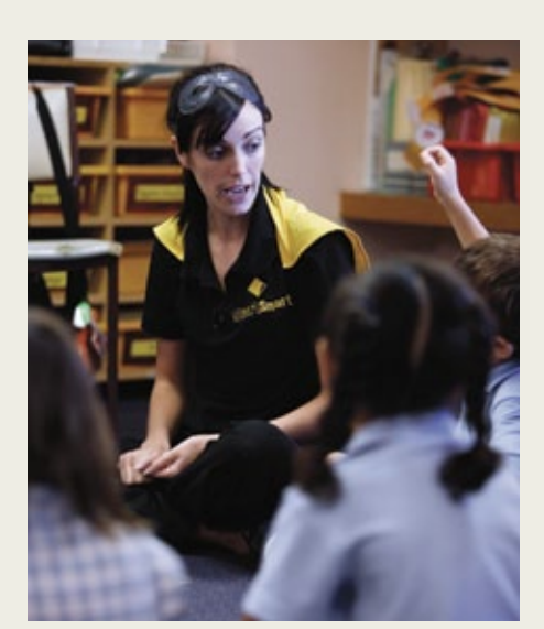
A StartSmart facilitator delivers an engaging learning experience to teach practical lessons in money management.