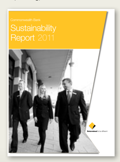
The full Sustainability Report 2011 is available at commbank.com.au/sustainability-reporting

The Group's annual Sustainability Report was released in October 2011 detailing key sustainability initiatives for the 2010-2011 financial year (commbank.com.au/sustainability-reporting).